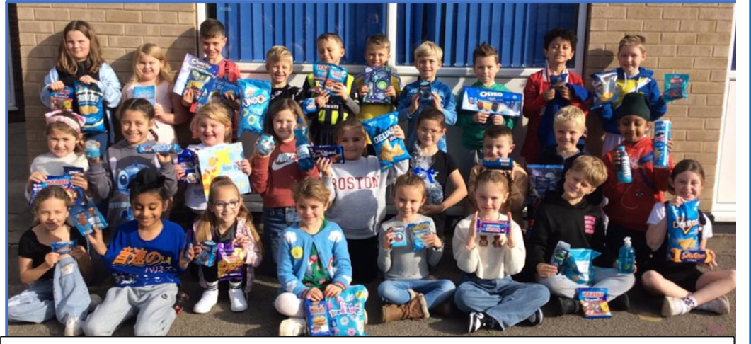
YEAR 3: Take a look at the amazing donations we have had to create our BLUE rainbow raffle hamper.

Tuesday 19th – Donc DSAT schools TAG rugby event Y3 & Y4 – Fit4Rugby leading