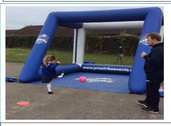
PROSTRIKE event was a huge success at Canon Popham yesterday – thank you everyone!

Monday 11th - Remembrance Service in church at 10.45am with Year 6 to lead Monday 11th - Friday 15th - Antibullying week 2024