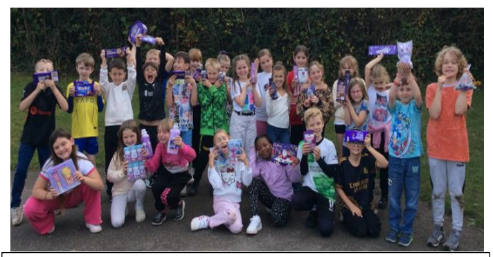
Rainbow Raffle Hamper Appeal We are so excited to sell raffle tickets for our PURPLE rainbow raffle hamper in Year 4!