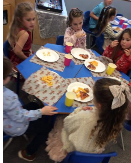
Christmas storytelling with Grandpa Sticks