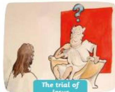
The trial of Jesus