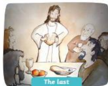
The last supper