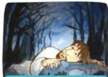
The Garden of Gethsemane and Peter's denial