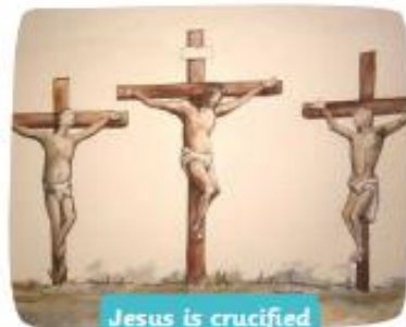
Jesus is crucified