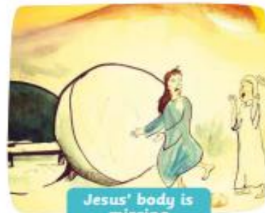
Jesus' body is missing

Lent is meant to be a time to reflect on our lives so we will encourage children to think about our life rules or values. In school we will do this through GUS and TOM . We will ask children to think of what they would be willing to Give Up Something . We will ask children to reflect on Taking On More