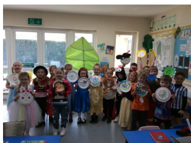
Year 1 showing their paper plate favourite book designs