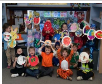
Well done, nursery – your paper plate favourite book designs looked amazing!